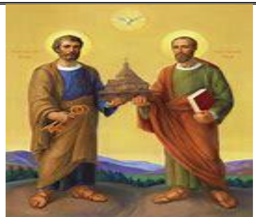
Feast of St. Peter and St. Paul